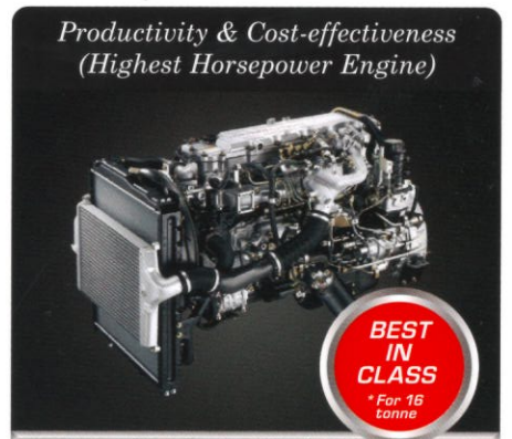
Productivity & Cost-effectiveness (Highest Horsepower Engine)