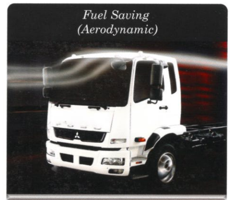
Fuel Saving (Aerodynamic)