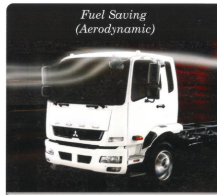
Fuel Saving (Aerodynamic)