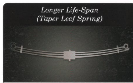
Longer Life-Span (Taper Leaf Spring)